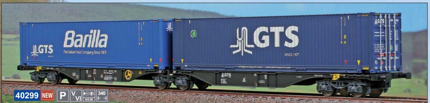
"Il treno della pasta". Carro bi-modulo da 90 piedi GTS con casse mobili "Barilla" e "GTS". "Pasta train". Container wagon Type Sggmrss '90 GTS with "Barilla" and "GTS" containers. "Der Nudel-zug. 90-Fuß-GTS-Bimodul-Wagen mit Barilla- und GTS-Wechselpritschen.