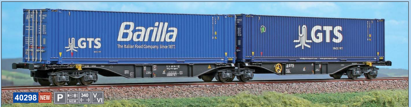
"Il treno della pasta". Carro bi-modulo da 90 piedi GTS con casse mobili "Barilla" e "GTS". "Pasta train". Container wagon Type Sggmrss '90 GTS with "Barilla" and "GTS" containers. "Der Nudel-zug. 90-Fuß-GTS-Bimodul-Wagen mit Barilla- und GTS-Wechselpritschen.