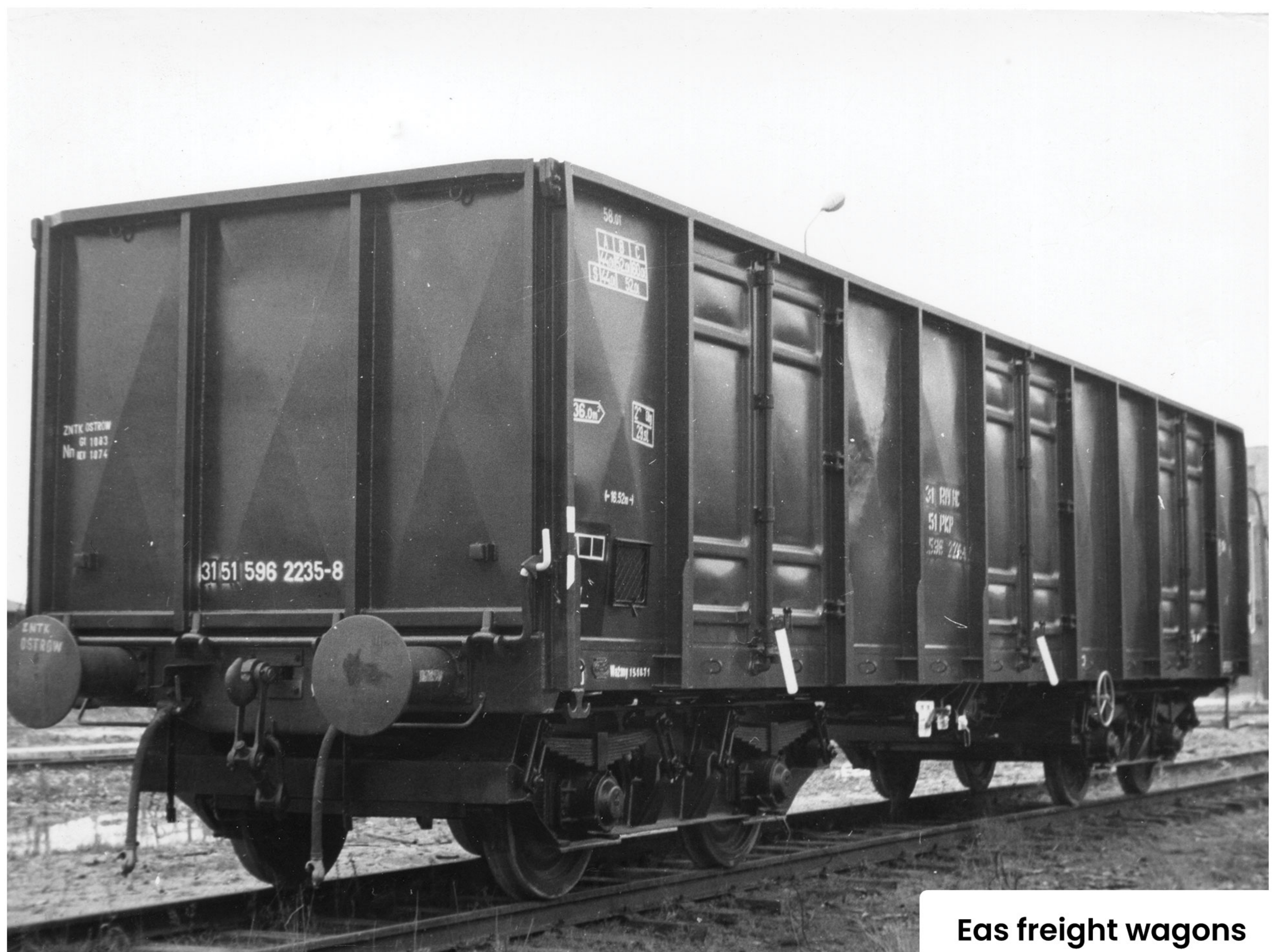
Eas freight wagons

Meticulously crafted miniature models for demanding collectors